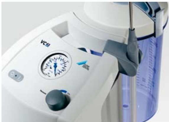
Maximum vacuum of up to 910 mbar