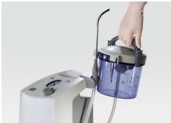
Removal of the secretion tank

During a surgical operation, the patient needs all the attention. Therefore the medical team needs to rely on powerful systems that work impeccably. Such is the infinitely variable VC 45 Surgical Suction Unit that meets surgical requirements with a suction volume of 45 l/min with a constant high vacuum of up to 910 mbar.